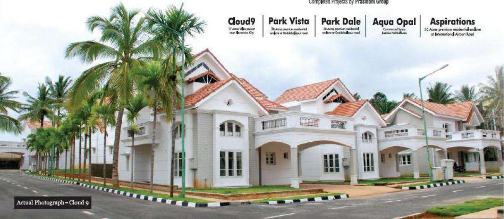
Actual Photograph - Cloud 9

50 Acres premium residential enclave at International Airport Road