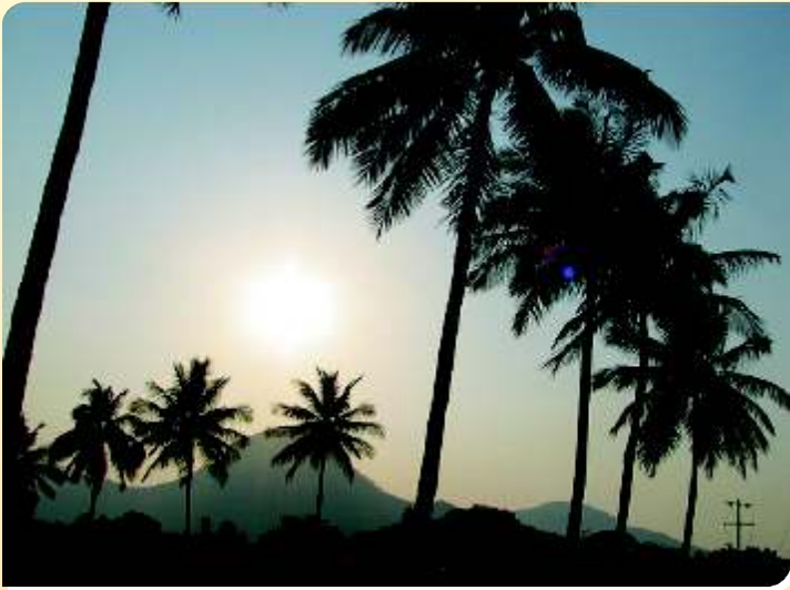
Scenic Splendour of Nandi Hills