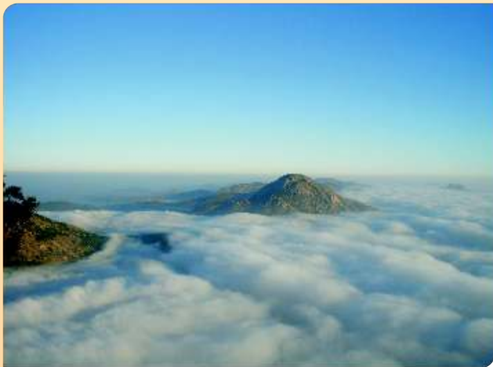
Boundless Bounty of Nature