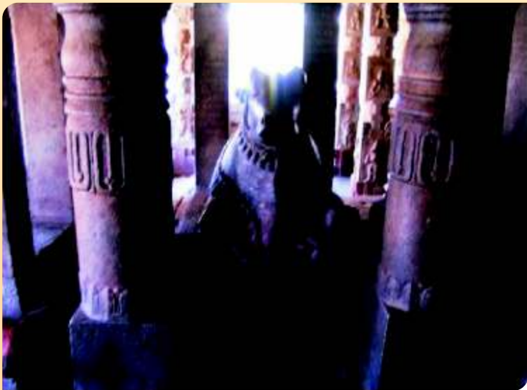
Bhoga Nandeeshwara Temple at Nandi Village