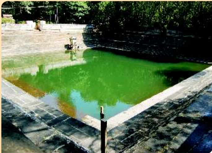
Water Tank atop Nandi Hills - Divine Blessing