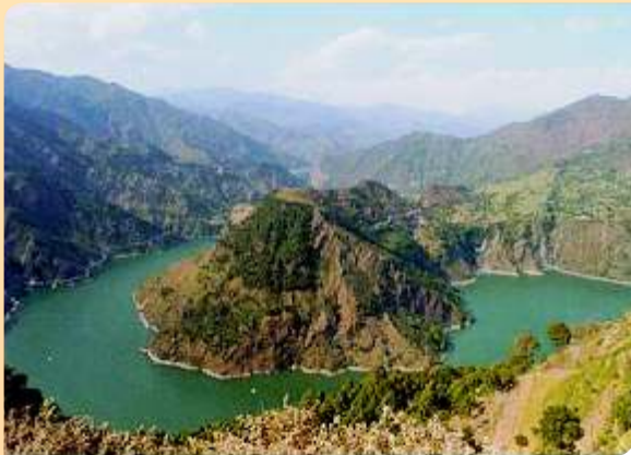
Picturesque Chitravathi River