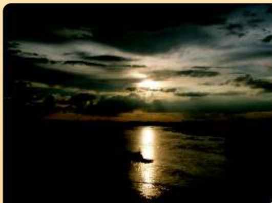
Mesmerising Sunset at Pennar River