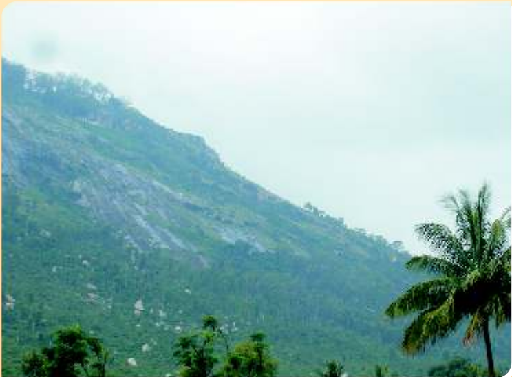
Nandi Corridor - The Serene Valley