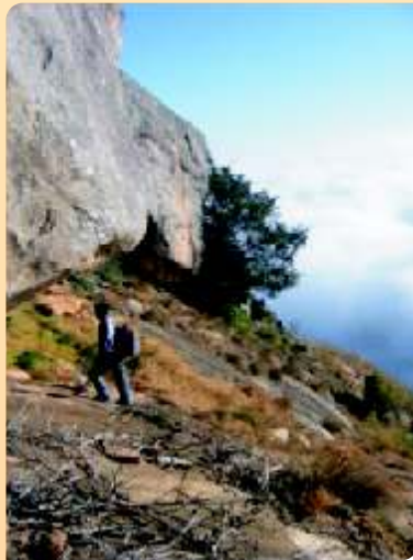
Skandagiri - A Lovely Place for Trekking