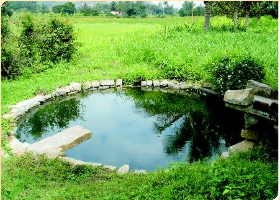
Sultanpet Village - A bundant Water Potential