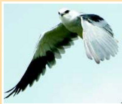
Kite in flight