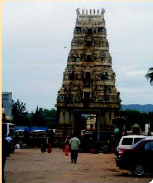
Ghati Subramanya Temple - Divine Power