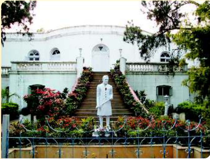
Nehru Nilaya at Nandi Hills 'Resplendent Bungalow of the Typical British Style'