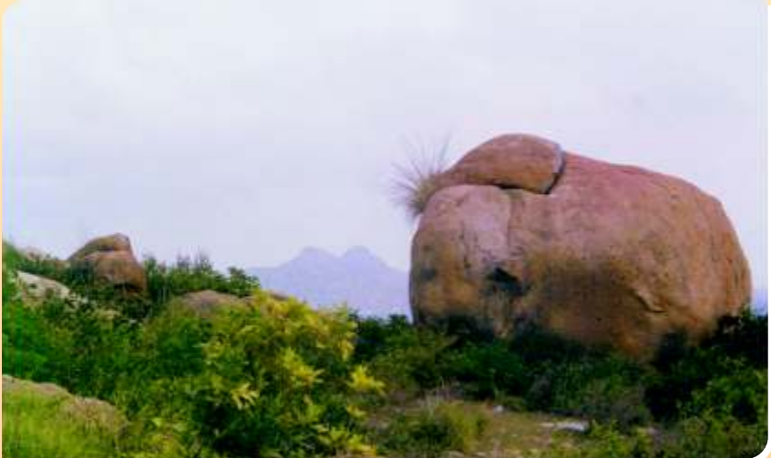
Panoramic Views of Skandagiri 'Whispering Winds and the Hills'