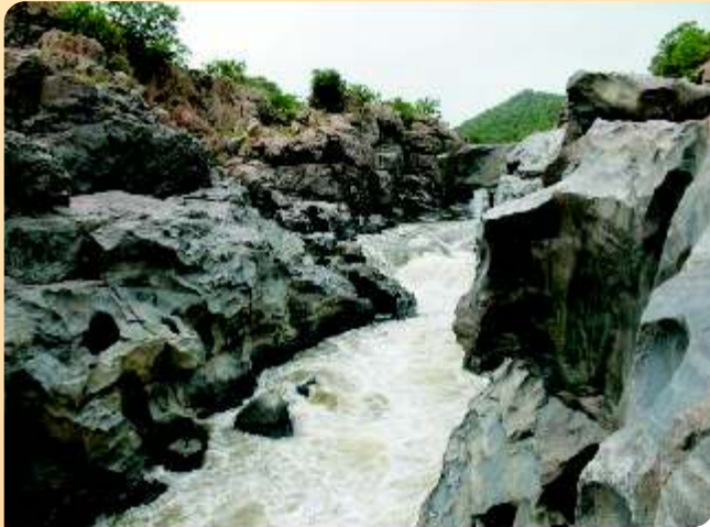
Arkavathi River - Celestial Turbulence